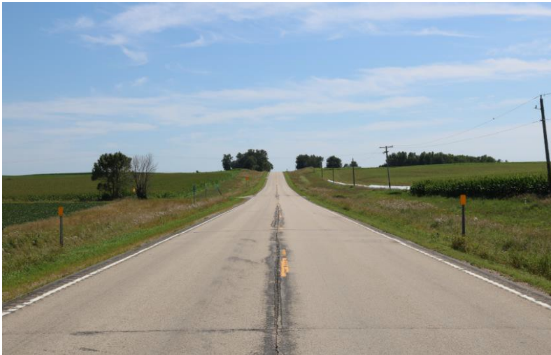
WN-ELT-056, August 1, 2019, View of culvert from TH 74 roadway, facing south.