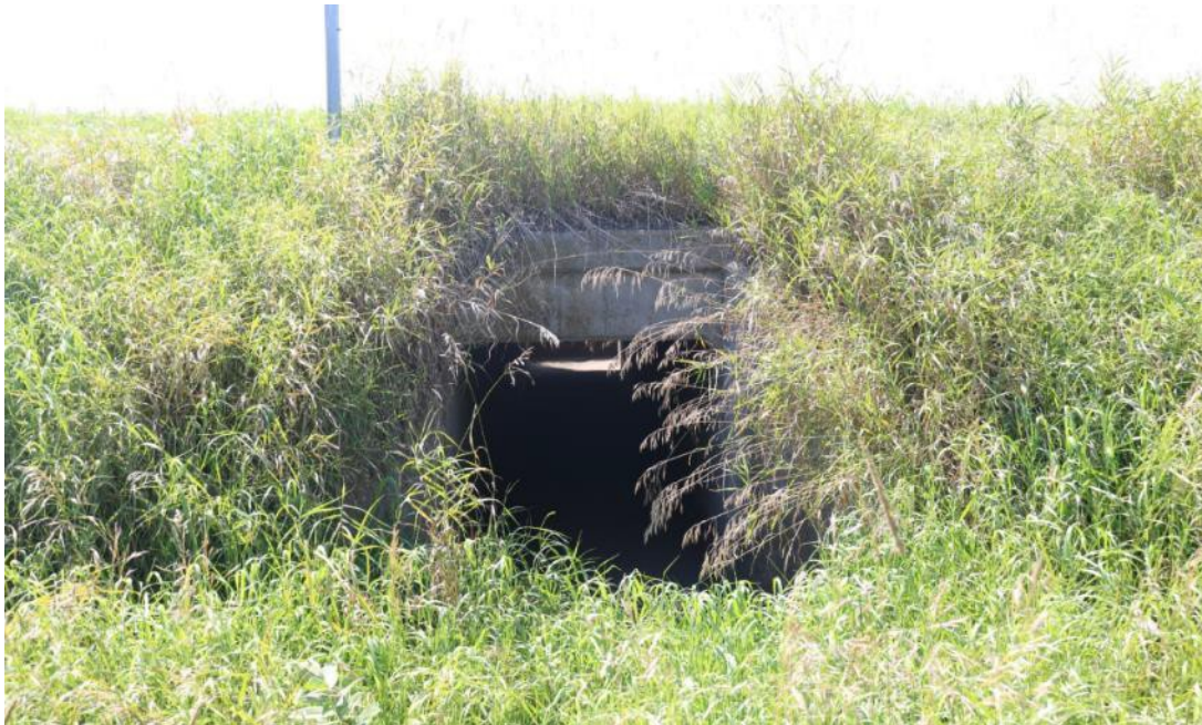
WN-ELT-056, August 1, 2019, East elevation of culvert, view facing west.