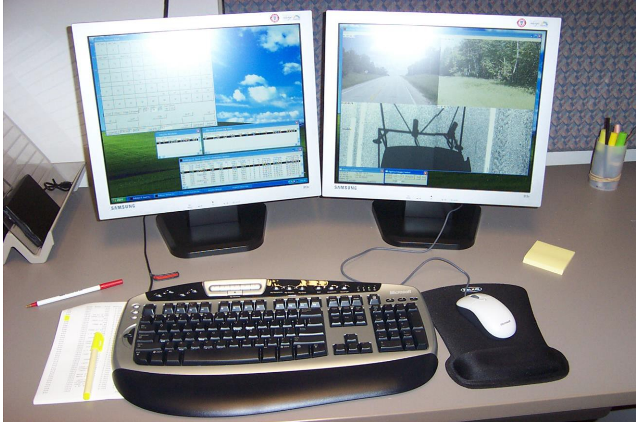
Figure 6. Digital Image Workstation

The workstations allow the operators to view and analyze the digital images captured by the van. The van captures four images that are shown on four monitors simultaneously. There is a front, side and two down views which help the operator determine the type and severity of each defect. On divided roads, each direction is treated as a separate road and rated separately. This is necessary because the type, age and rehabilitation history may vary from one side of a divided road to another causing a difference in pavement performance. The software assists in the calculation of the quantity of distress.