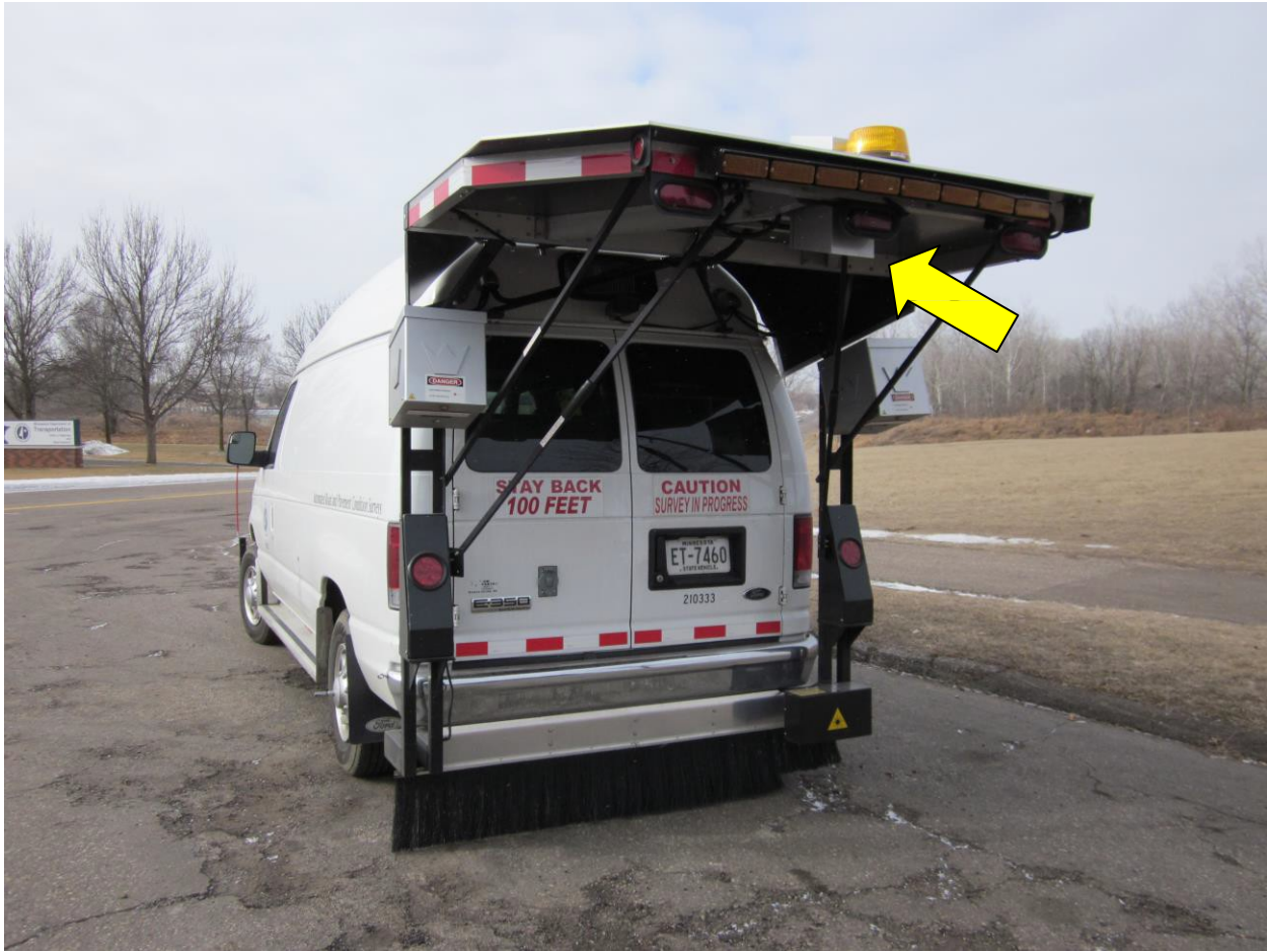
Figure 4. Close-up of 3D camera used to record pavement distress.