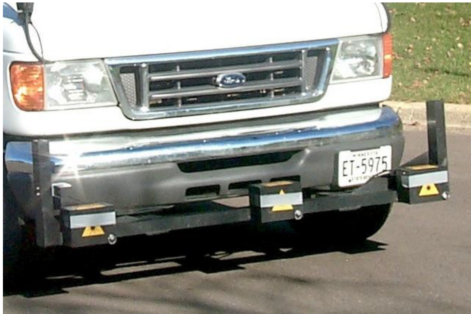
Figure 2. Close-up of lasers used to measure roughness & faulting.

compare the performance of different roadways, pavement designs and for project planning and programming.