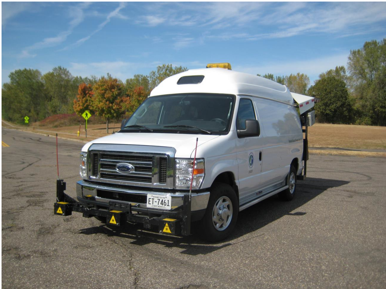
Figure 1. MnDOT's Pathway Services, Inc. Digital Inspection Vehicle (DIV)

MnDOT currently collects pavement condition data using a Pathway Services, Inc. Digital Inspection Vehicle (DIV) as shown in Figure 1. There are three lasers mounted across the front bumper, one in each wheel path and one in the center (Figure 2). In addition, there are two lasers used for rut measurements (Figure 3) and for collecting 3-dimensional images of the pavement surface (Figure 4) mounted on the rear of the vehicle. The front lasers measure the pavement's longitudinal profile, used to calculate roughness. They take a measurement approximately every 1/8-inch as the van travels down the roadway at highway speed. The cameras are used to capture the pavement distress (cracking, patching, etc.), right-of-way images, and help assess the overall condition of the shoulders.