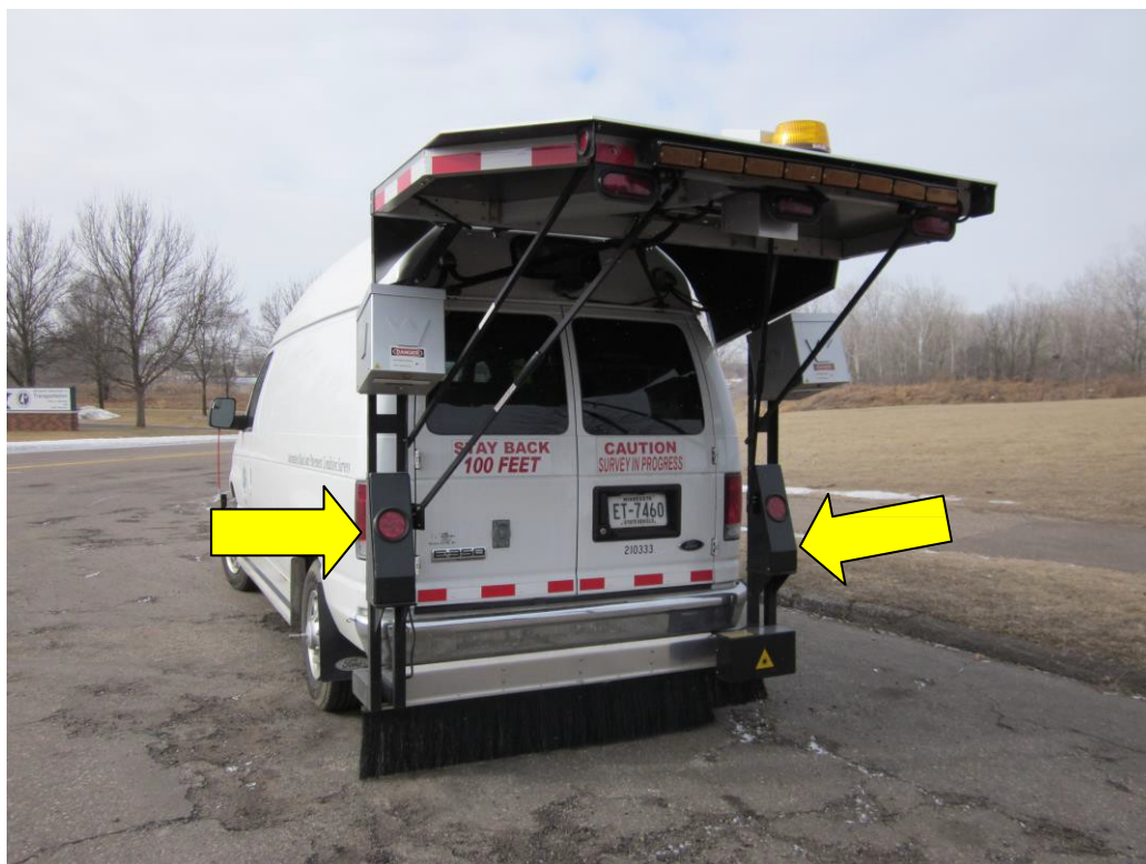
Figure 3. Close-up of 3D-Rut Measurement Lasers.