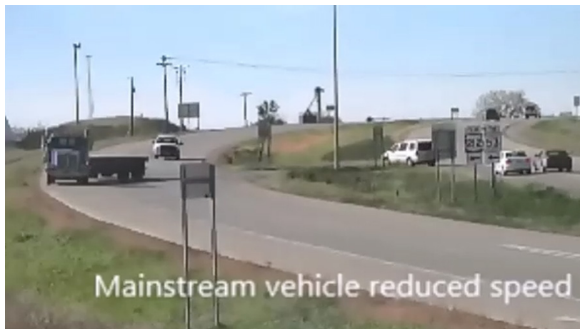
Video capture of large truck after U-turn maneuver at one of the reduced conflict intersections with driver in on-coming lane of traffic slowing down

Within Minnesota's rural corridors, introduction of RCI design has been successful in preventing severe crashes; however, the unusual design has been met with some apprehension from operators of agricultural equipment and large trucks. This, in combination with a resistance to the unfamiliar, has created a desire for more information regarding RCI configuration safety impacts for these types of vehicles.