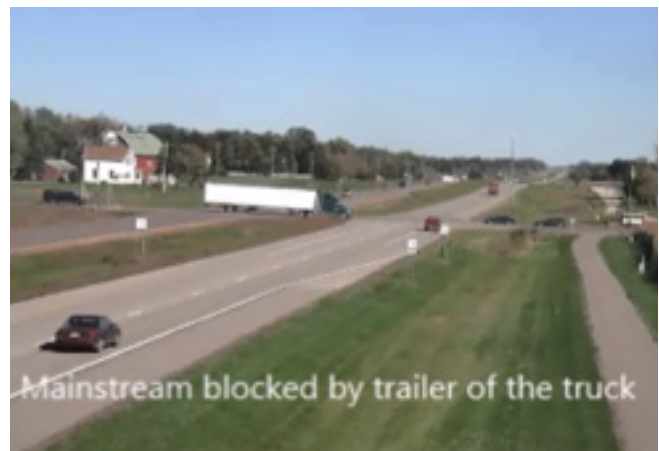
Video capture of semi truck trailer blocking on-coming traffic for more than 20 seconds at one of the control intersections

Finally, the researchers compared evasive maneuvers (situations where an on-coming vehicle has to brake, slow, or change lanes to avoid the large vehicle crossing the intersection). The team recorded about 0.16 evasive maneuvers per large vehicle at the Cologne RCI merge point and 0.11 evasive maneuvers at the U-turn. At the Cologne control intersection, the researchers recorded 0.33 evasive maneuvers per large vehicle.