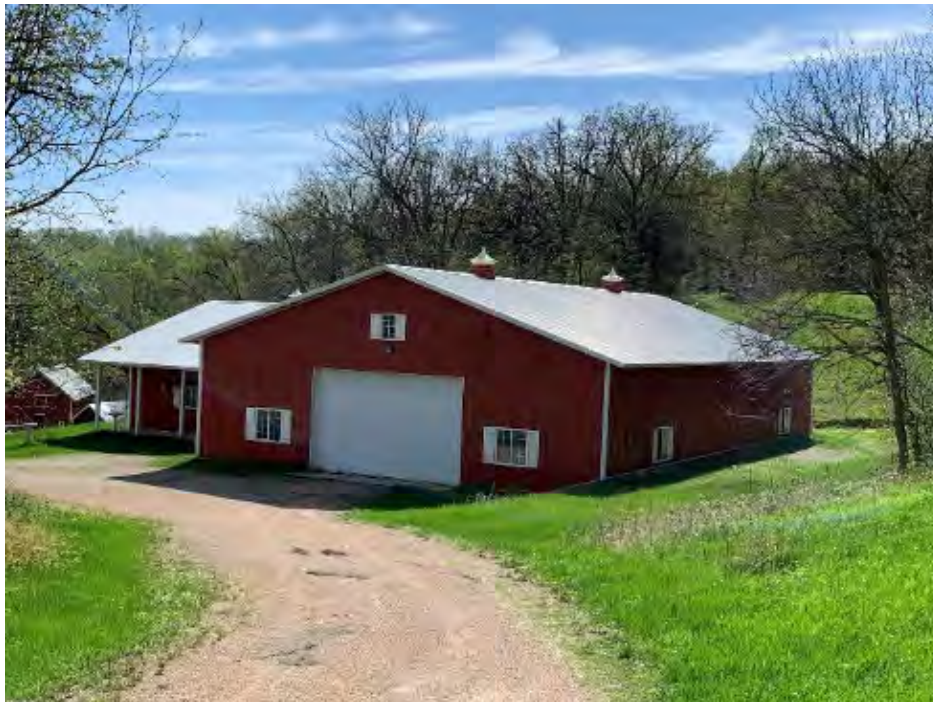
Pole Barn with heated workshop