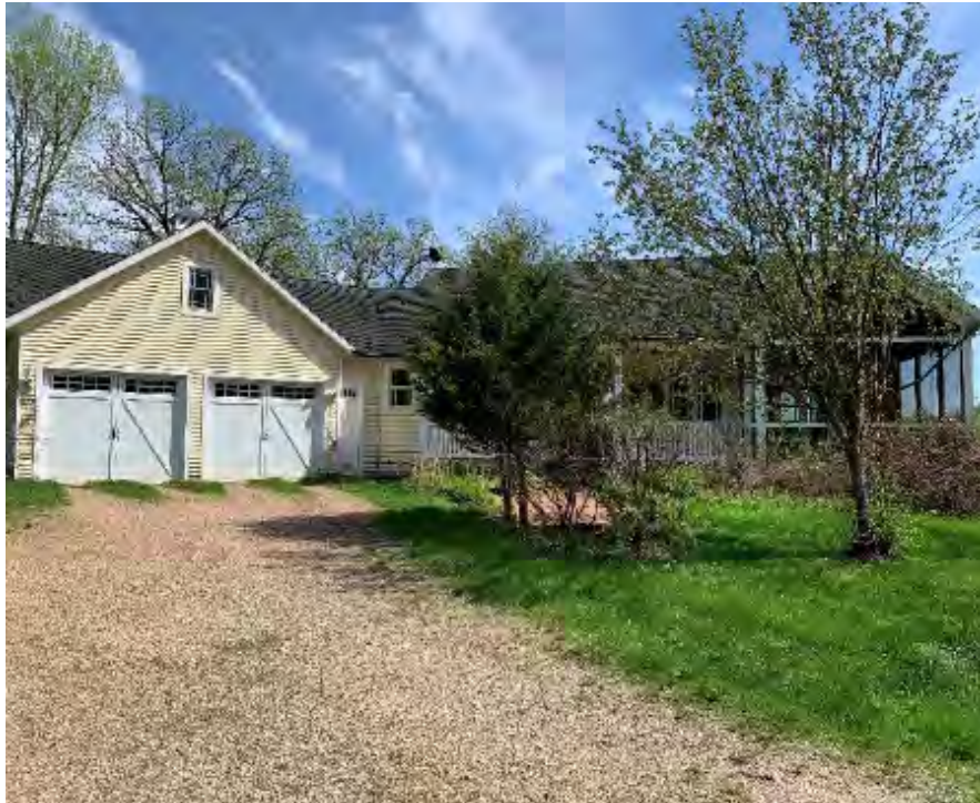
Single Family Home with two car attached garage