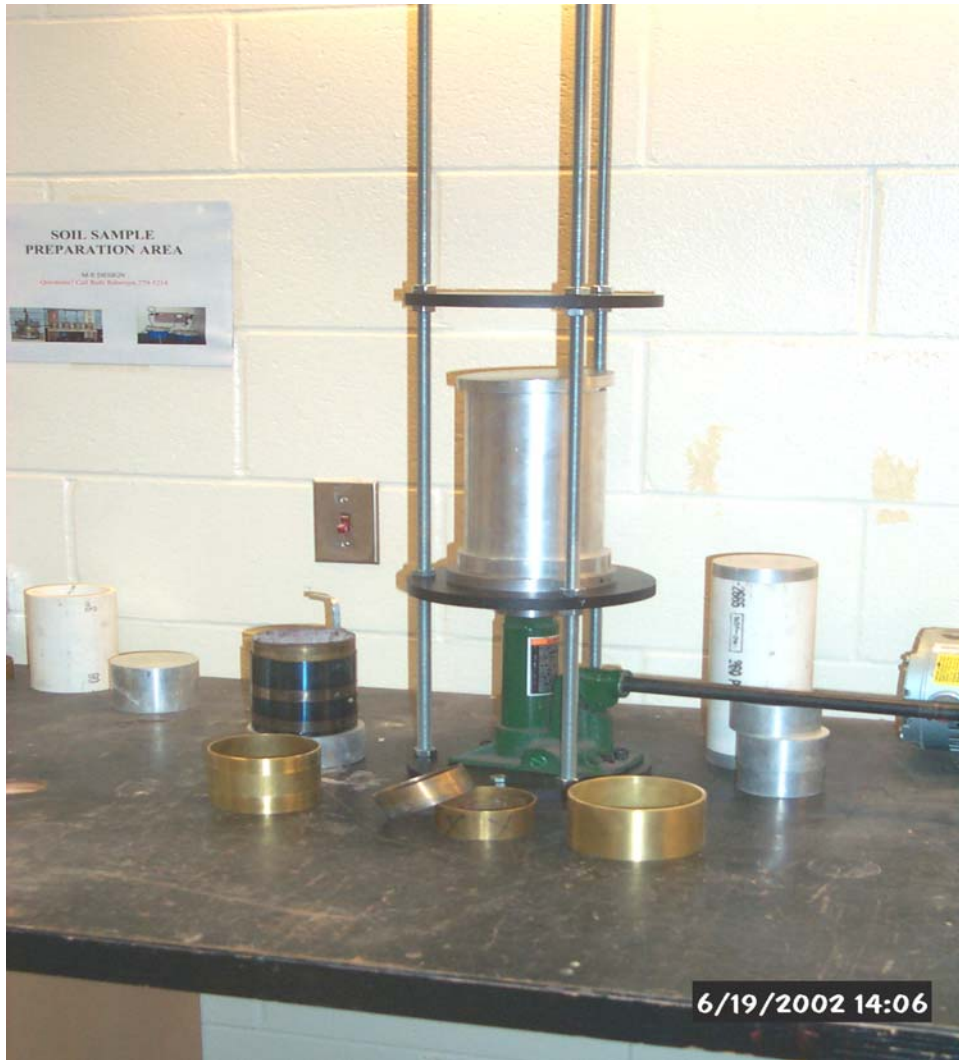
Figure 2: Soil Press